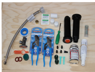
Indoor/Outdoor Leak Repair Kit