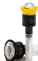
RainBird HE-VAN/ RVAN Nozzles