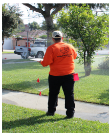
Landscape Assessment & Irrigation Survey