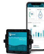
Flume SmartWater Meter Monitor