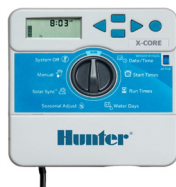
Hunter X-Core Smart irrigation Controller