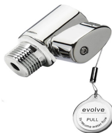
Evolve Shower Start