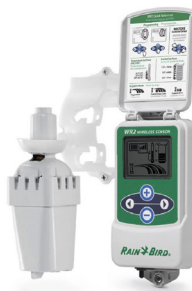
RainBird Wireless Rain Sensor