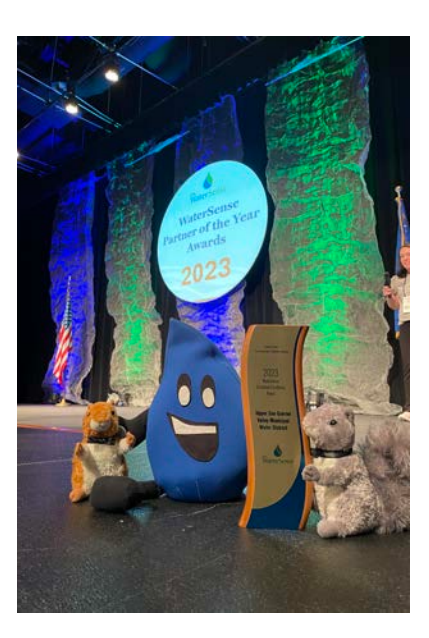
Award with Uppy and Nutty squirrels